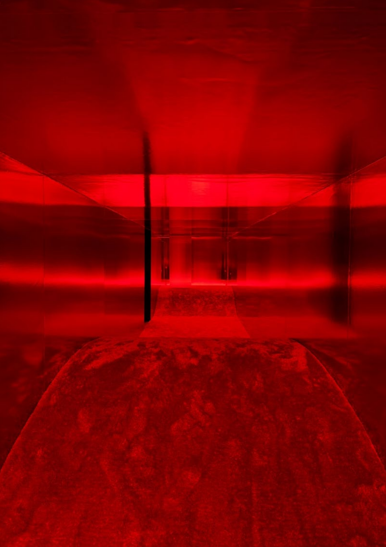
Lucio Fontana and Nanda Vigo, view from the installation Ambiente Spaziale « Utopie », nella XIII Triennale di Milano, 1964-2017