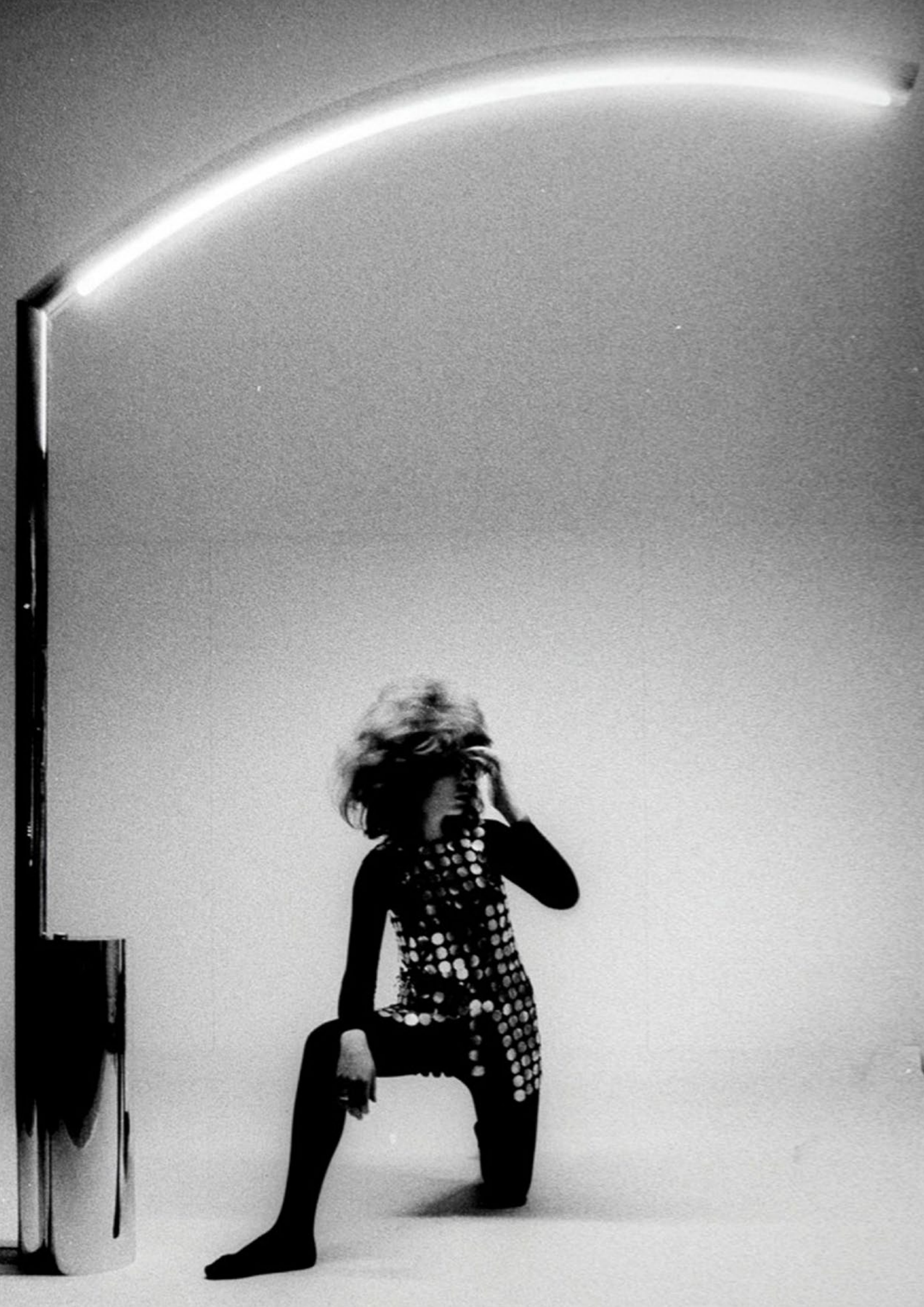
Nanda Vigo, Golden Gate lamp, Arredoluce edition, 1969-70