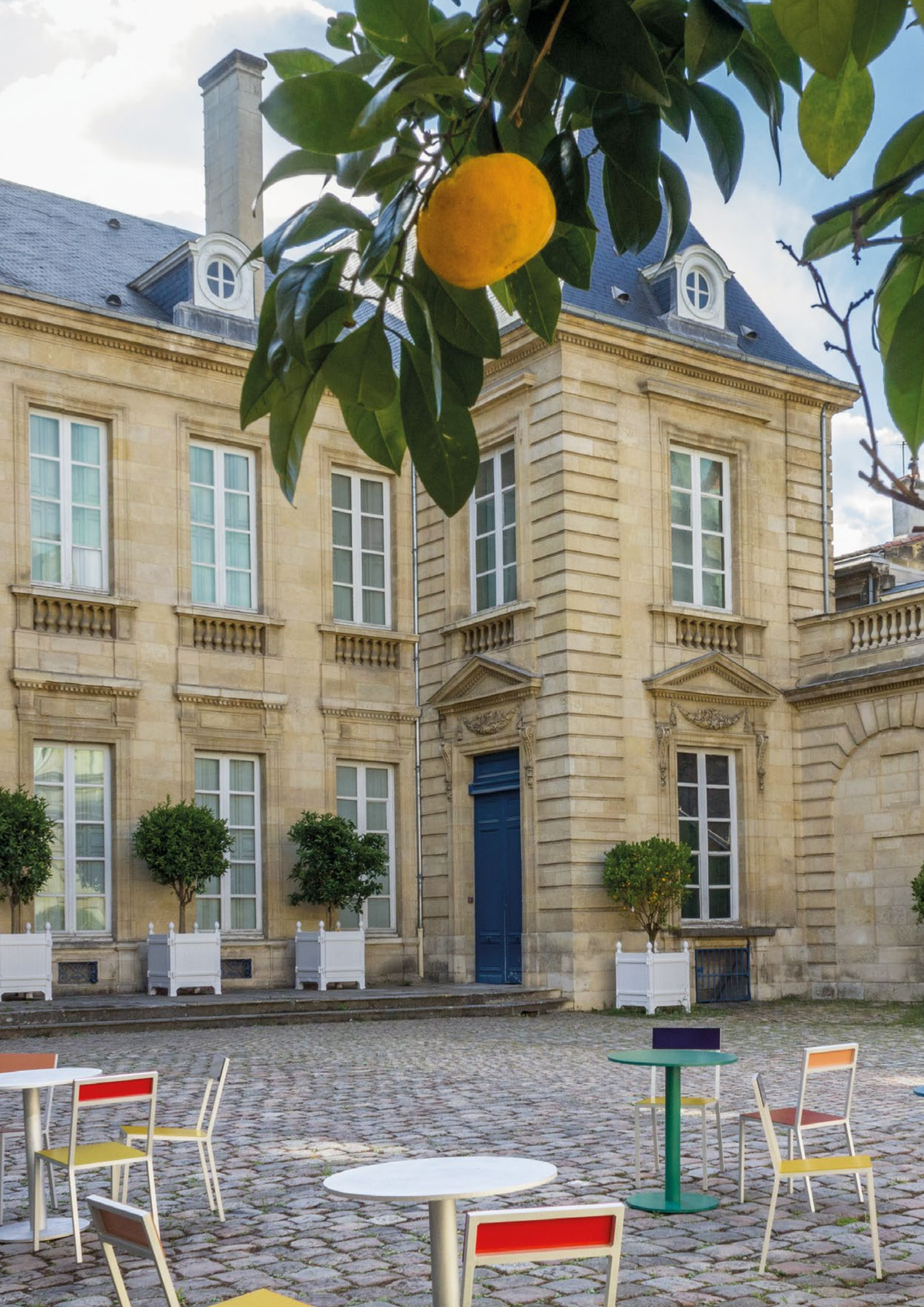
Outdoor furniture designed by Muller Van Severen