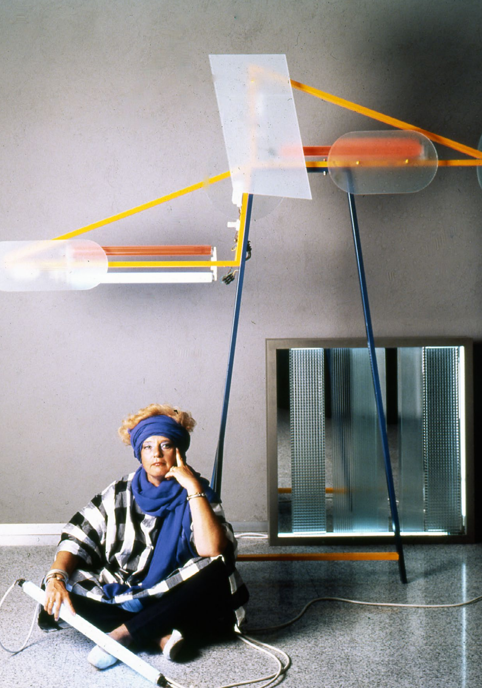
Portrait of Nanda Vigo, for the Domus magazine cover in 1985

Nanda Vigo's creations are permanently presented at the Triennale Design Museum in Milan, in the collection of the Italian Ministry of Foreign Affairs, at the Museo del Novecento in Milan and at the Castello di Rivoli. In 2014, she exhibited at the Guggenheim Museum in New York as part of the retrospective dedicated to ZERO. In 2015, within the Zero. Die Internationale Kunstbewegung der 50er und 60er Jahre exhibition program, she exhibited at the Martin-Gropius-Bau in Berlin and at the Stedelijk Museum in Amsterdam.