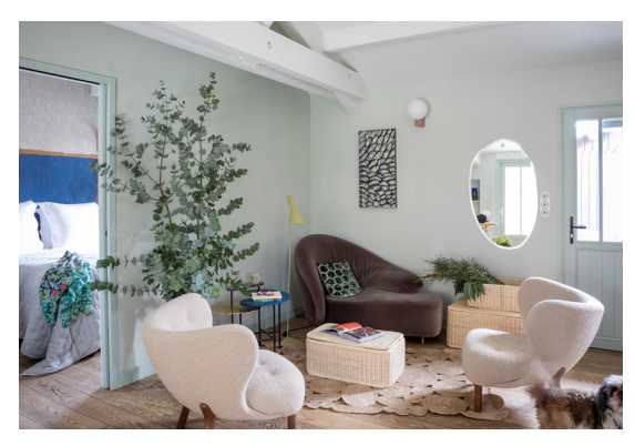
Cabane YNDO

of works on site, which will be exhibited at the fair by his gallery, Harlan Levey Projects (Belgium), who is participating in BAD+ Bordeaux Art & Design for the first time.