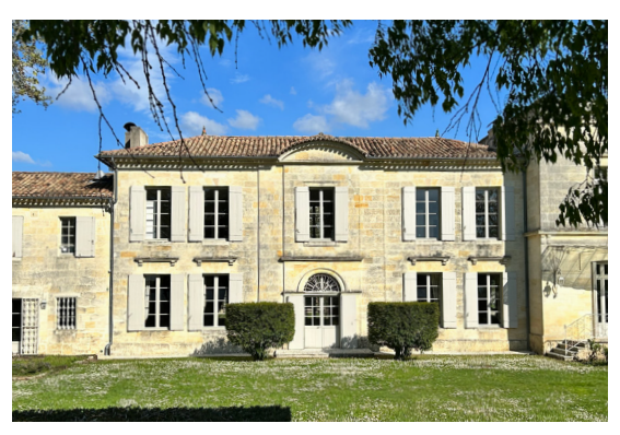
Chateau Larteau

is a partner of the fair for this 3rd edition. For this occasion, this 18th century château situated on the Dordogne riverbanks and surrounded by legendary vineyards, will host an exhibition of works by leading French and international contemporary artists.